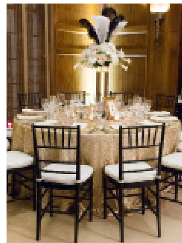
A beautiful table ready for guests and catering by McCalls.